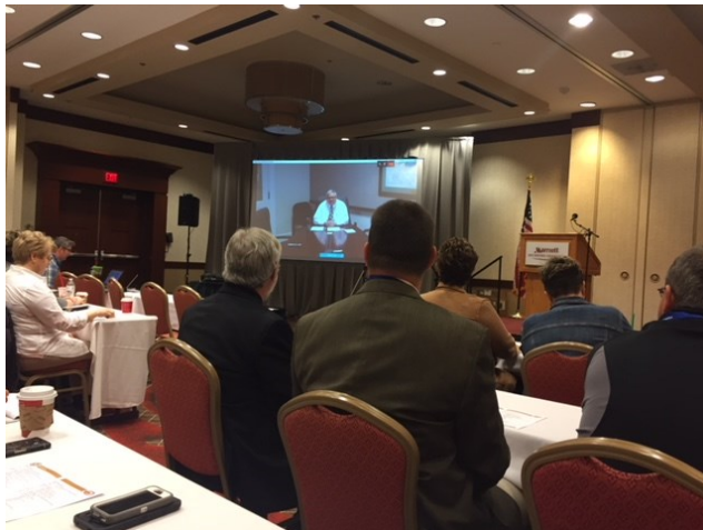
Live Teleconference with Undersecretary Bill Northey

Undersecretary Northey mentioned the 1997 reorganization combined CO and GS. FPAC is not a reorganization, but a realignment of agencies. Each unit (FSA, NRCS, and RMA) will each maintain their own identity. The hiring of 300 employees are planned for this year by FPAC. These will be split between the three agencies. The plan is to be back to October levels by the end of this fiscal year, including back fills due to promotions from within.